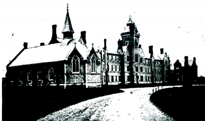
Bedfordshire Middle Class Public School at the time of its opening [Z50/67/67]