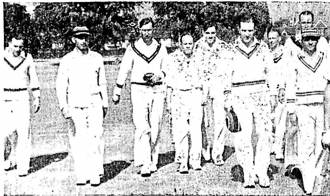
The Bedfordshire team leaving the field after dismissing Hertfordshire for 246 runs on Friday.