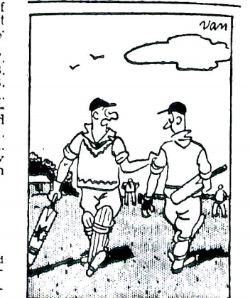
"Watch out for that new fast bowler, old chap."

Wyobston beat Tempford by 55 runs in a St. Neots Carnival Competition game.