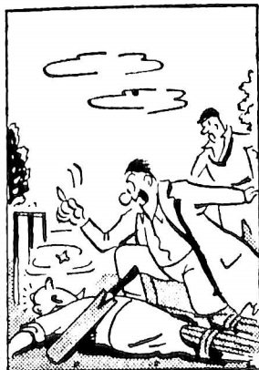
"EIGHT - NINE - TEN - OUT"

Bedfordshire v. Hertfordshire (Bedford School), and Saturday. Filwick v. R.A.F. Henlow.