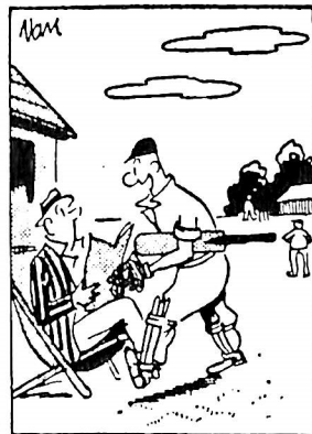
"Oh, yes—now where was I?"