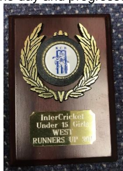
Above u15s West Kent runners up trophy 2011

The school ended up as runners up on the day and progressed to the county finals.