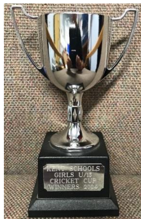
2004 u15 Kent Champions Trophy

In 2004 the school had success in becoming Kent u15 schools' girls cricket champions in an outdoor competition. Regretfully no stats are available.