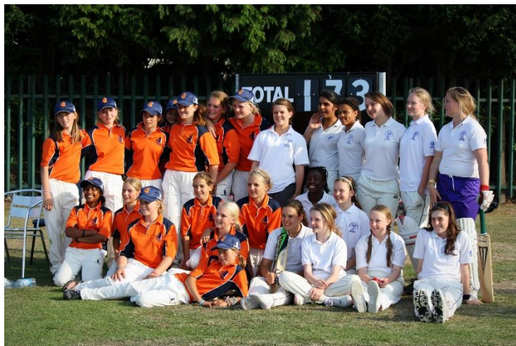
The Netherlands team line up with C+S GS

C+S u13 (173-7 in 30 overs) beat The Netherlands u13 (161-4 in 30 overs). Hardball Friendly. The school actually reached the winning total in 28 overs but batted on to give both teams some extra match practice. The visiting team were on a 3 match tour of Kent and the remainder of their itinerary was against Bells Yew Green and St.Lawrence + Highland Court.