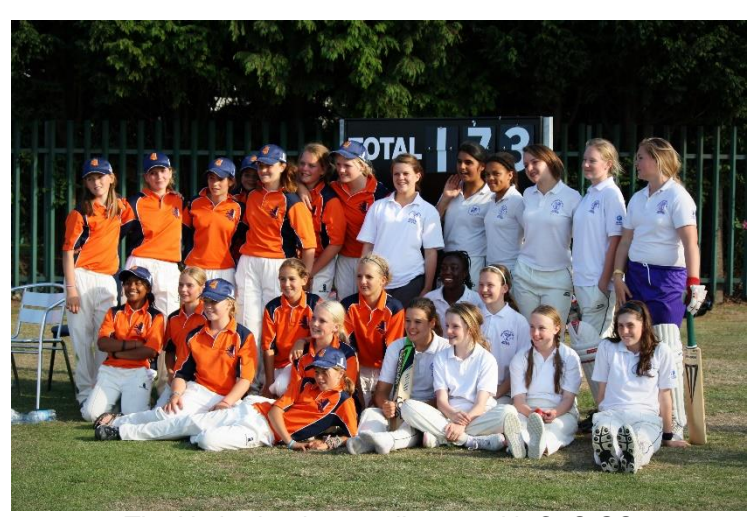
The Netherlands team line up with C+S GS

C+S u13 (173-7 in 30 overs) beat The Netherlands u13 (161-4 in 30 overs). Hardball Friendly. The school actually reached the winning total in 28 overs but batted on to give both teams some extra match practice. The visiting team were on a 3 match tour of Kent and the remainder of their itinerary was against Bells Yew Green and St.Lawrence + Highland Court.