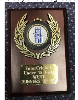
Above u15s West Kent runners up trophy 2011

The school ended up as runners up on the day and progressed to the county finals.