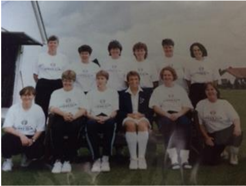
Same West Midlands v West Indies match – front row 3 rd from left.