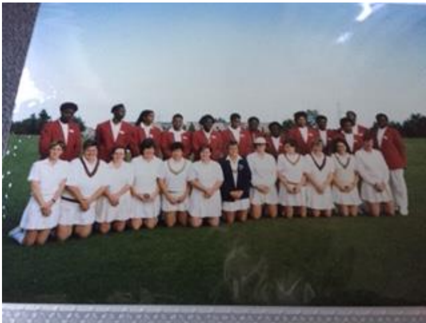
West Midlands v West Indies, I can't recall the year, I am front row first on left