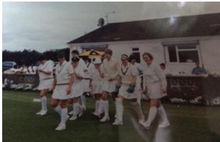
Taking the field against West Indies, left of wicket keeper